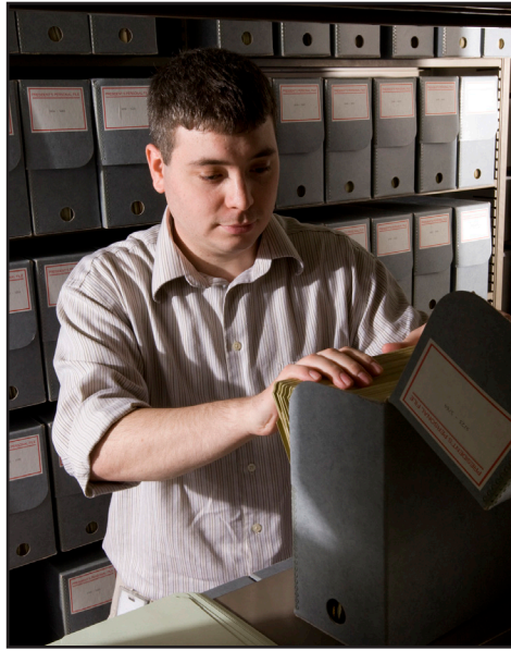
FDR PRESIDENTIAL LIBRARY

The reasons why I love working at the Roosevelt Library are many. First, answering research queries provides me with the opportunity to