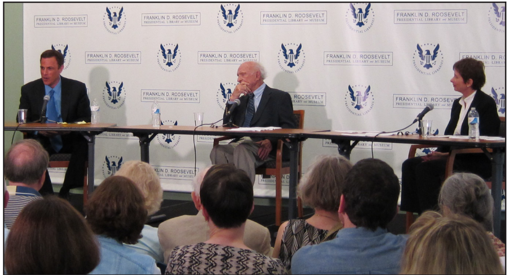
FDR PRESIDENTIAL LIBRARY

His study of FDR led Burns to explore more fully the nature of leadership, and his 1978 book Leadership is still considered the seminal work in the field of leadership studies. His theory of transactional and transformational leadership has been the basis for more than 400 doctoral dissertations. He received his B.A. from Williams College, his PhD in political science from Harvard, and attended the London School of Economics. He is currently the Woodrow Wilson Professor of Government Emeritus at Williams College.