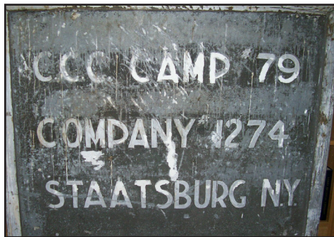
FDR PRESIDENTIAL LIBRARY

In April, the Roosevelt Library and Museum received an unusual object connected to the local history of a popular New Deal agency—the Civilian Conservation Corps (CCC).