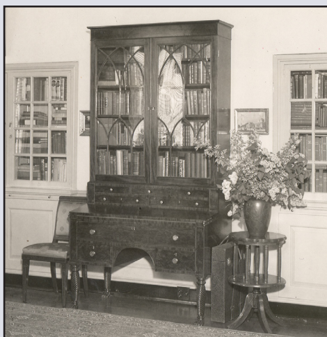
FDR PRESIDENTIAL LIBRARY