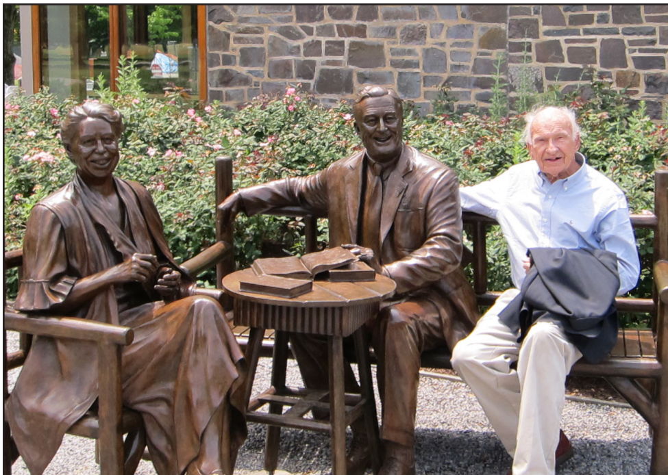
FDR PRESIDENTIAL LIBRARY

Now 92, James MacGregor Burns has stated that his appearance at the Roosevelt Reading Festival was his last public appearance. The Roosevelt Library is honored that Burns began his exemplary career here in 1952 as researcher #392 and that he chose the 2011 Roosevelt Reading Festival for his valedictory appearance nearly 60 years later.