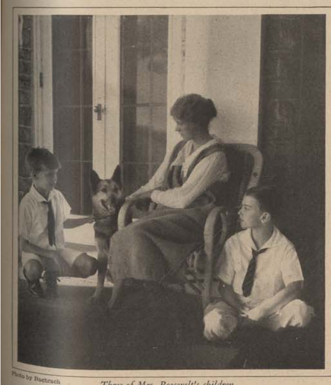
Three of Mrs. Roosevelt's children.

Men who work hard in party politics are always recognized, or taken care of in one way or another. Women, most of whom are