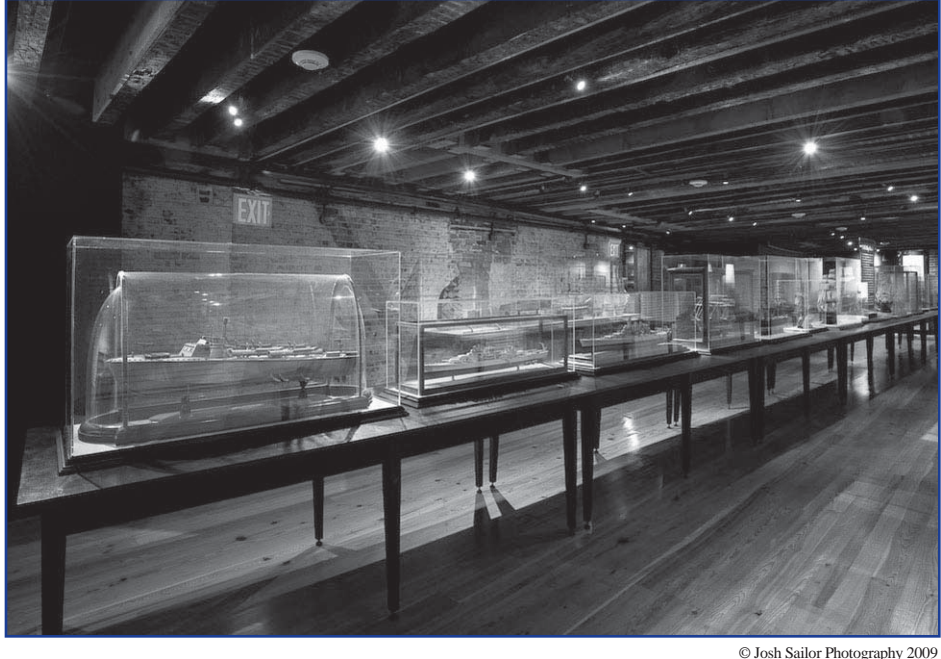
A highlight of the Treasures of a President exhibition is a gallery of nearly 30 ship models resembling the "Naval Room" of the Roosevelt Library-one of the original galleries when it opened its doors in 1941. Today the FDR Presidential Library has over 400 ship models from FDR's personal collection.

Roosevelt's naval and maritime collecting was most intense during 1913-20 when he was assistant secretary of the navy and then