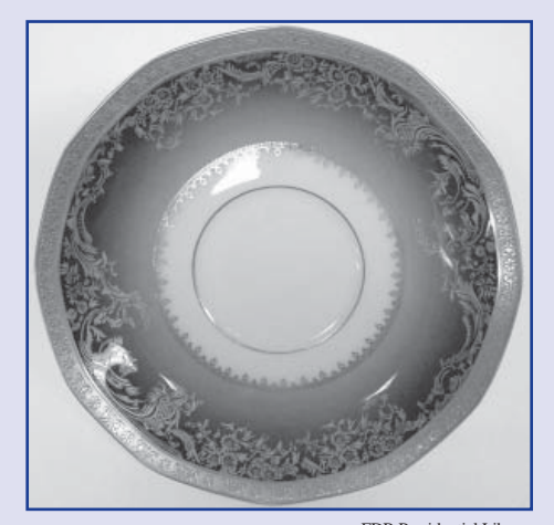
FDR Presidential Library Saucer, Haviland Porcelain, France, 1938. Part of a five-piece set of luncheon place settings used at Hvde Park and the White House.

examples of folk art and treasures from around the world that came to the Roosevelts as gifts. Descended from old families, the Roosevelts' collections also contain noteworthy early American silver, jewelry, and antique furniture.