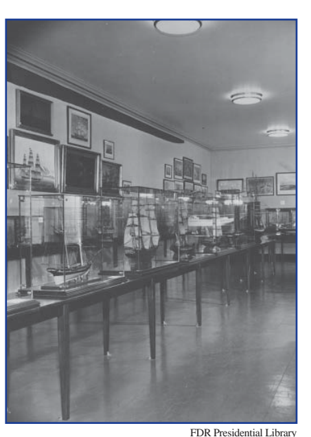
Historic photo of the Naval Room at the FDR Library as it looked in 1941.

Room, which showcased Roosevelt's ship model and naval print and painting collections when the Library opened in June 1941.