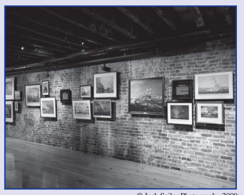
Paintings and prints from FDR's naval history collection can be seen in the Treasures of a President exhibition at the South Street Seaport Museum.

The Roosevelt Library will soon begin a multi-year renovation project that includes a rare and wonderful opportunityinstallation of a "visible storage" facility that allows visitors to walk through museum storage areas and view up close thousands of items that have rarely, or never, been on display.